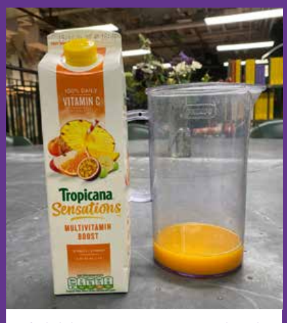
A fruit juice recommended portion size

We know that portion sizes influence how much we eat. Put simply, larger portions encourage us to eat more — and shape our view of what is a normal amount to eat. There is debate around whether portion sizes on-pack should represent what people actually consume or what they should consume and it's not clear which of these two types of information has a bigger influence.