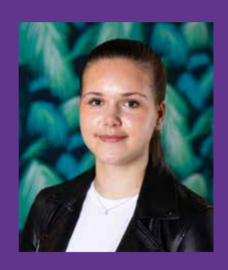
Emily Bite Back 2030 Youth Board

"All of us have trust issues, but I didn't expect to have trust issues with the food system too. Isn't everyone tired of the lack of transparency and honesty in the food system? Aren't we all tired of falling in the trap of believing health claims? Eating healthily should be easy, and let me tell you something – it isn't."