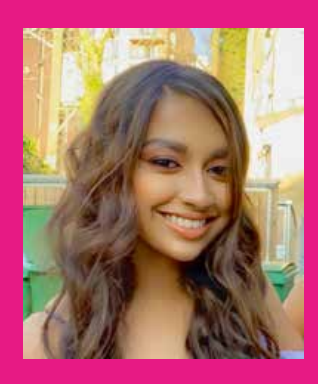
Anisah Bite Back 2030 Youth Board

"Just wow. It should be easy to eat healthily! It's so sad that young people such as myself are falling victim to these claims. It's time that we say we've had enough. I'm fed up of companies exploiting loopholes in the laws that control how food is promoted and branded."